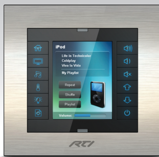
Brushed Aluminum Bezel