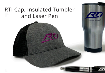
RTI Cap, Insulated Tumbler and Laser Pen