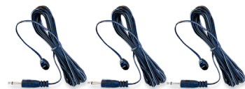
vIRsa Mouse IR Emitters