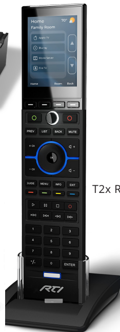
T2x Remote Control