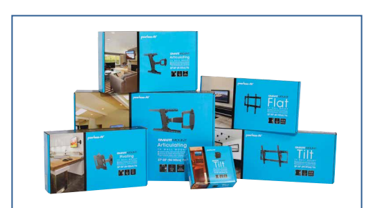
Comes in color packaging with included installation hardware and easy to follow instructions.