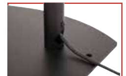
Cable management through the pole or base