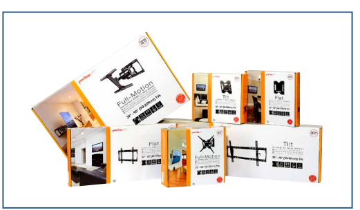
Comes in color packaging with included installation hardware and easy to follow instructions.

Low-profile design for a sleek, yet compact installation.