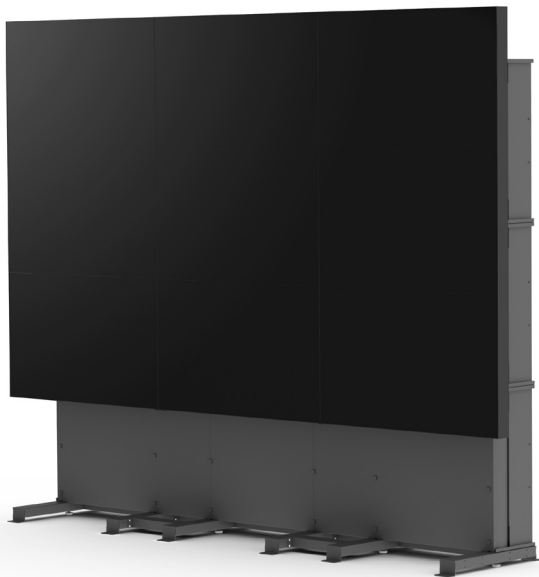
Icon Floor Ace 4x4 55", with covers (optional).