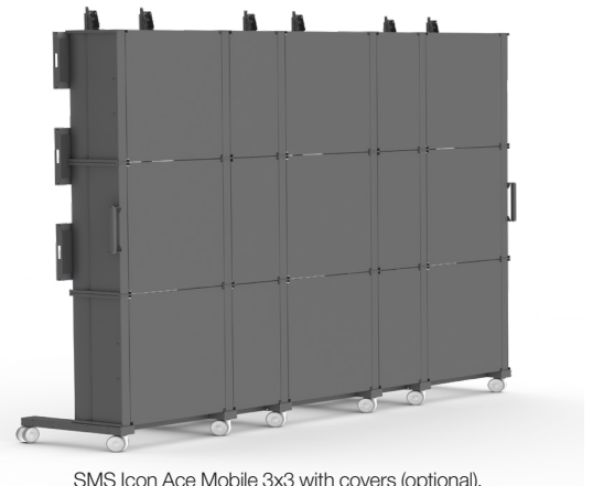
SMS Icon Ace Mobile 3x3 with covers (optional), seen from behind.