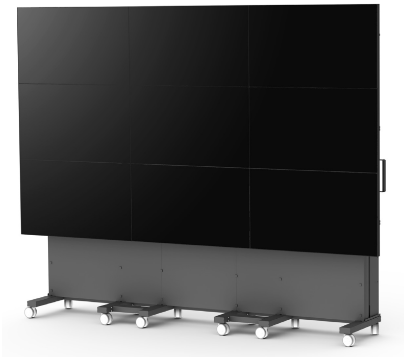
SMS Icon Ace Mobile 3x3 - sturdy wheels and handles are included, covers are an accessory (optional).

Technical drawing and more info is available at our website, www.smartmediasolutions.se .